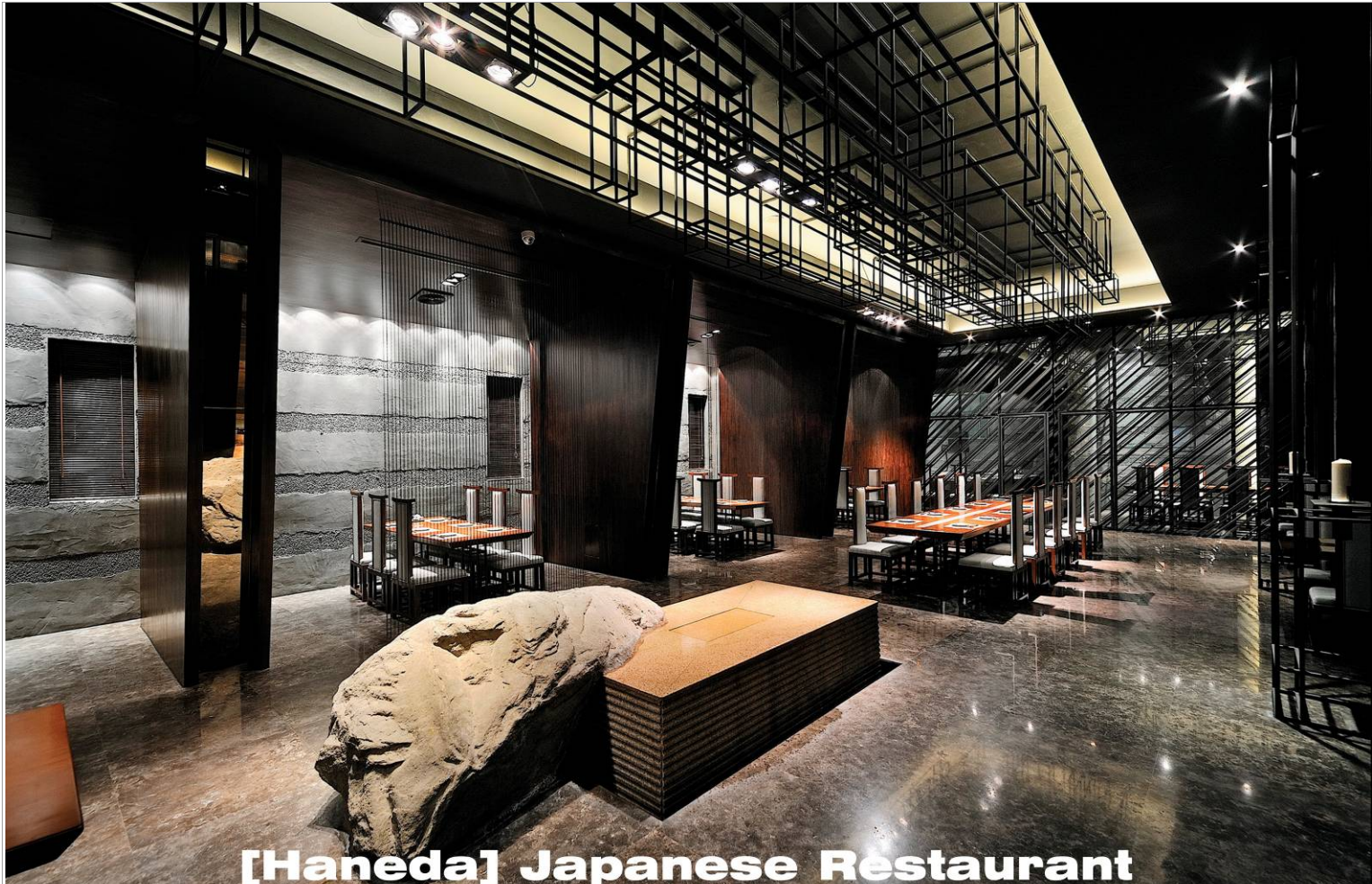
[Haneda] Japanese Restaurant [羽田]日本料理餐廳